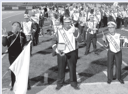
Woodward Band proudly performs in competition at Clyde.