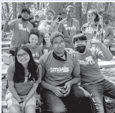
SMART students enjoy a field trip to a park!

A message from the Woodward Hall of Fame Committee: We will be following the most current, up-to-date COVID restrictions at the time of the banquet.