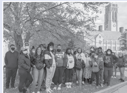
WHS students tour UT.