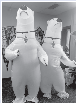
A pair of Polar Bears during Homecoming!